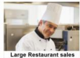
Large Restaurant sales