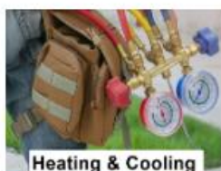
Heating & Cooling