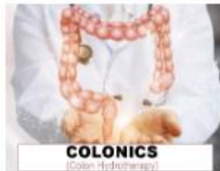
COLONICS (Colon Hydrotherapy)