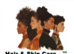
Hair & Skin Care With Shopping Cart