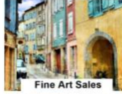
Fine Art Sales