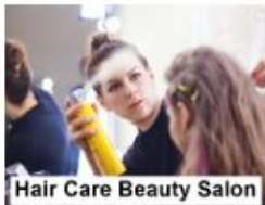
Hair Care Beauty Salon