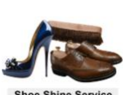
Shoe Shine Service