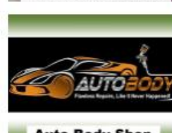
Auto Body Shop