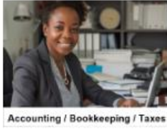
Accounting / Bookkeeping / Taxes