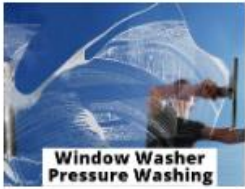
Window Washer Pressure Washing