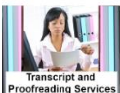
Transcript and Proofreading Services