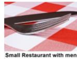
Small Restaurant with menu