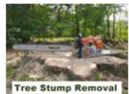
Tree Stump Removal