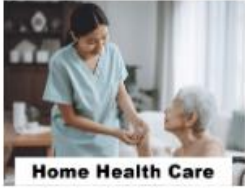
Home Health Care