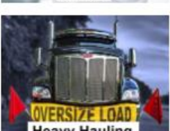
OVERSIZE LOAD Heavy Hauling